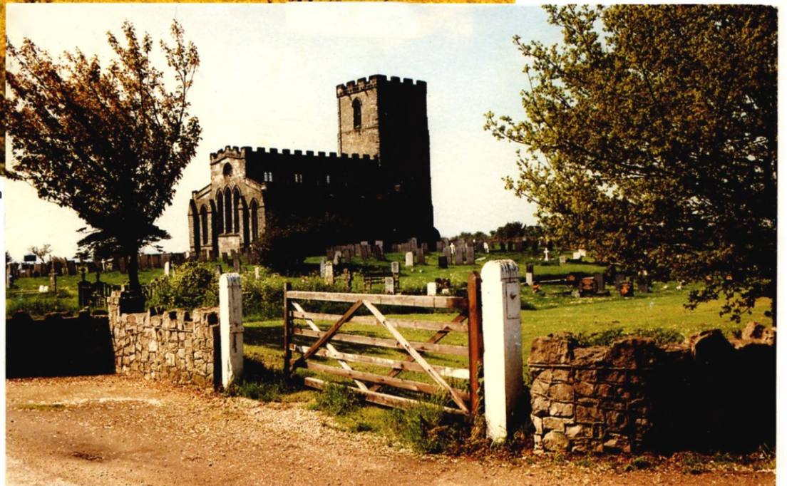
The Parish Church, Breedon on the Hill