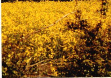
The Parish Church, Breedon