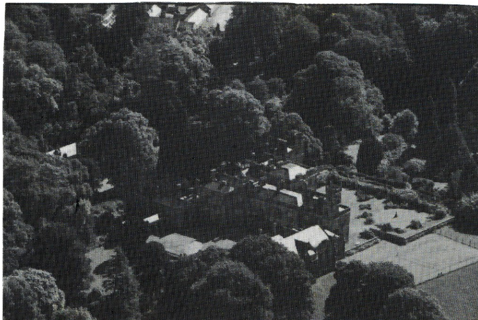
Shirley Estate in Ireland