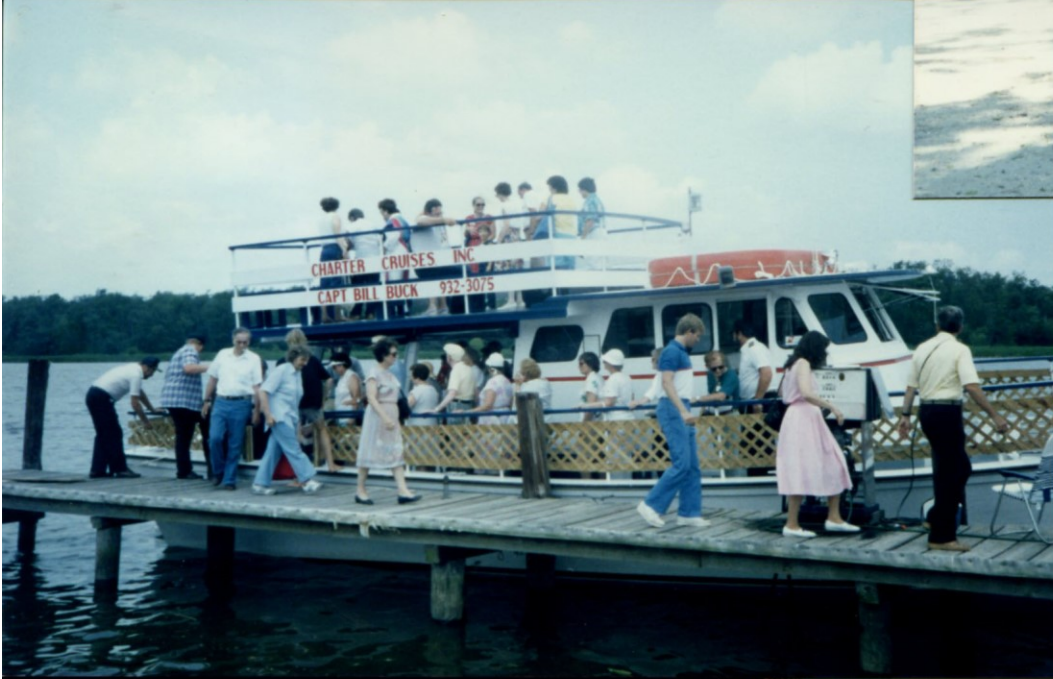
T/L-Shirley Convention in Williamsburg, Va.