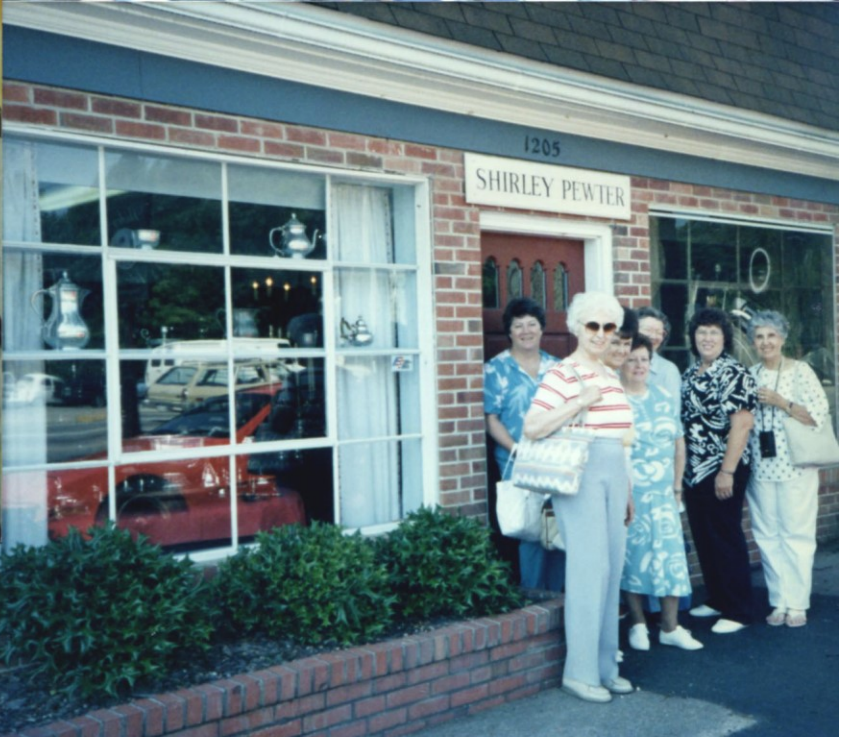
T/L- Shirleys with Lincoln, in Gettysburg, Pa. LEFT Chandelier & stairs at Gov. Wm. Shirleys Boston, Mass. T/R & center at Gov Shirleys. R- Pewter store Jamestown, Va. He's not a Shirley.