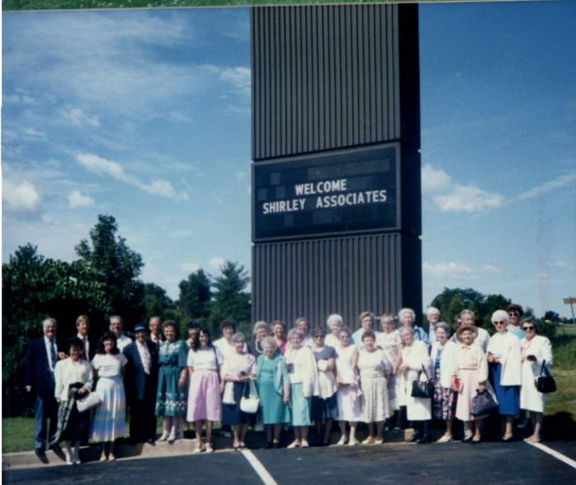
Top Left and Right-

Lunch at the Shirley Plantation in Virginia on the James River.