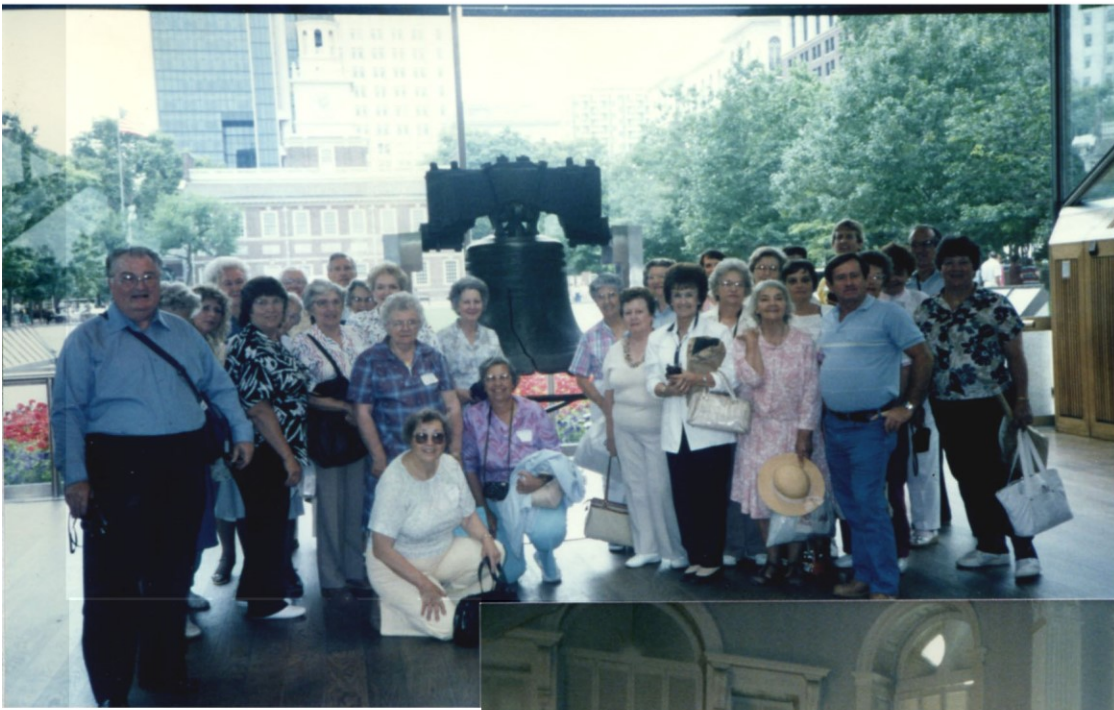
Left- Shirleys on tour in front of the Liberty Bell, Philadelphia, Pa.